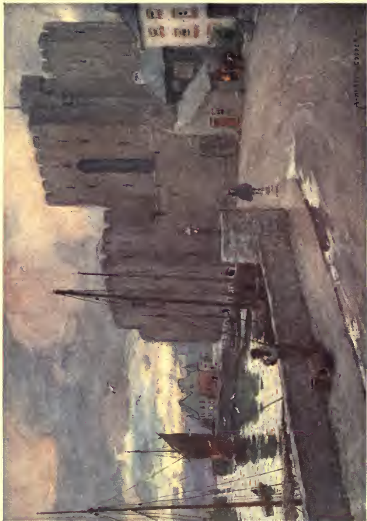
CASTLETOWN AND CASTLE RUSHEN.

Up to 1862 this was the capital. The grim Castle with its massive keep overlooks the harbour and is one of the most interesting features of the island.